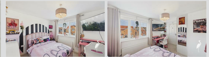
2x double glazed windows to front elevation, radiator and built in wardrobe. Door to en-suite.