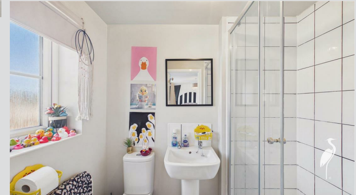
Low level WC, washbasin and shower cubicle, radiator and double glazed window.