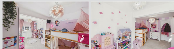
Double glazed window to rear elevation and radiator.